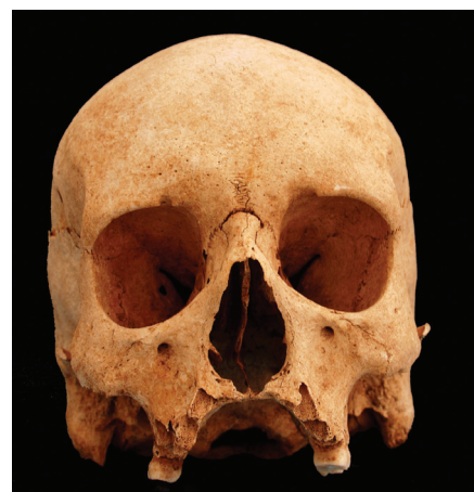
Figure 2. Advanced stage of lepromatous leprosy ( facies leprosa ) characterized by severe resorption of the central maxilla accompanied by enlargement of the nasal aperture in an adult male recovered from the Early Medieval Radašinci cemetery in Dalmatia.