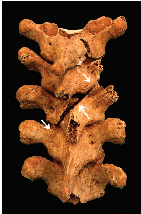
Figure 7. Perimortem trauma to the second, third, and fourth thoracic vertebrae in an adult male also recovered from the Udbina cathedral archaeological site. The injuries were clearly inflicted with a sharp edged weapon most likely a sword or saber.

education and sports of the Republic of Croatia; the project: „Bioarchaeological analyses of medieval populations from Croatia“ (from 2007-2013) and the project “The effects of endemic warfare on the health of Historic period populations from Croatia” (from 2014-2018) funded by the Croatian Science Foundation.