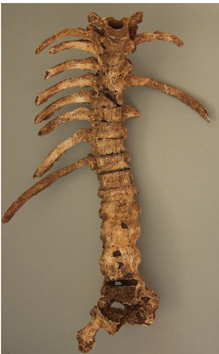
Figure 4. Ankylosing spondylitis in an adult male from the Late Medieval site Koprivno. The spine of this individual exhibits clear evidence of ankylosing spondylitis or Marie-Strümpell's Disease. The following vertebrae are fused: C3 through C7, as well as T3 through T10. In addition, T5 through T10 are fused with the corresponding right ribs, while T4 through T7 are fused with the corresponding left ribs. All of the vertebrae exhibit preserved but narrowed intervertebral spaces and developed marginal syndesmophytes.

syphilis (Figure 3), rheumatic diseases (Figure 4), as well as numerous examples of ante- and perimortem trauma (mostly sharp-force and blunt injury trauma, Figures 5-7), making it a unique source of information, important both