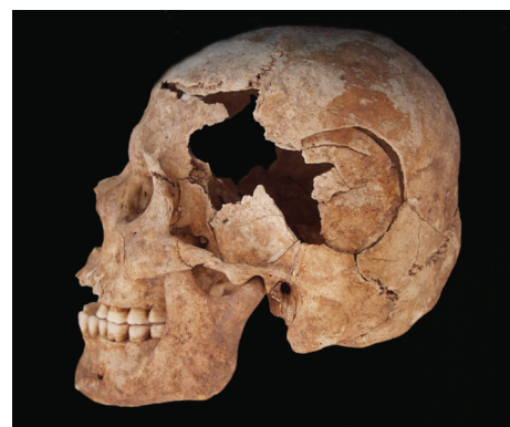
Figure 6. Perimortem trauma to the left temporal region of the skull in an adult male recovered from the Udbina cathedral. This individual likely perished in the Battle fought on the field of Krbava in 1493 between a Croat army led by Ban Derenčin and a large force of Ottoman akndji led by Jakub paša. This injury may have been inflicted by a mace.

for bioarchaeological and forensic anthropology studies (25). It is, therefore, no surprise that this collection is used by both national and international colleagues (at present data from this collection has been utilized in the completion of 15 Graduate, 5 Masters, and 7 PhD thesis in Croatia and one Masters and 3 PhD thesis in the USA) and utilized in a large number of international scientific projects. These projects include the joint Smithsonian Institution – Croatian Government project „Development of a Forensic Data base at the University of Zagreb“ funded by the Government of the Republic of Croatia and the State Department of the USA through the Smithsonian Institution (from 1995-2000); the collaborative project: “Development of an archaeological, bioarchaeological and paleontology database for Croatia“ (from 2003-2007), a project that consisted of six projects from the fields of archaeology, anthropology, paleontology and linguistics and was funded by the Ministry of Science,