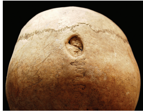
Figure 5. Antemortem blunt force trauma located in the cranium of an adult male from the Late Medieval Kozica cemetery in Dalmatia.

syphilis (Figure 3), rheumatic diseases (Figure 4), as well as numerous examples of ante- and perimortem trauma (mostly sharp-force and blunt injury trauma, Figures 5-7), making it a unique source of information, important both