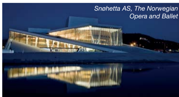
Snohetta AS, The Norwegian Opera and Ballet

Predavanja o suvremenoj norveškoj arhitekturi održat će se 26. travnja 2012. u 18 sati, na Arhitektonskom fakultetu, Fra Andrije Kačića Miošića 26, Zagreb. / Lectures about Contemporary Norwegian Architecture at the Faculty of Architecture in Zagreb on 26th April at 18:00, Fra Andrije Kačića Miošića 26, Zagreb.