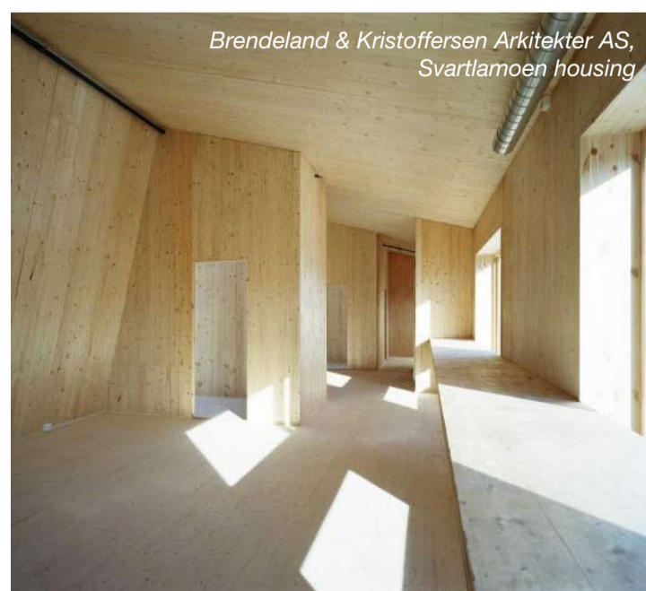
Brendland & Kristoffersen Arkitekter AS, Svartlamoen housing