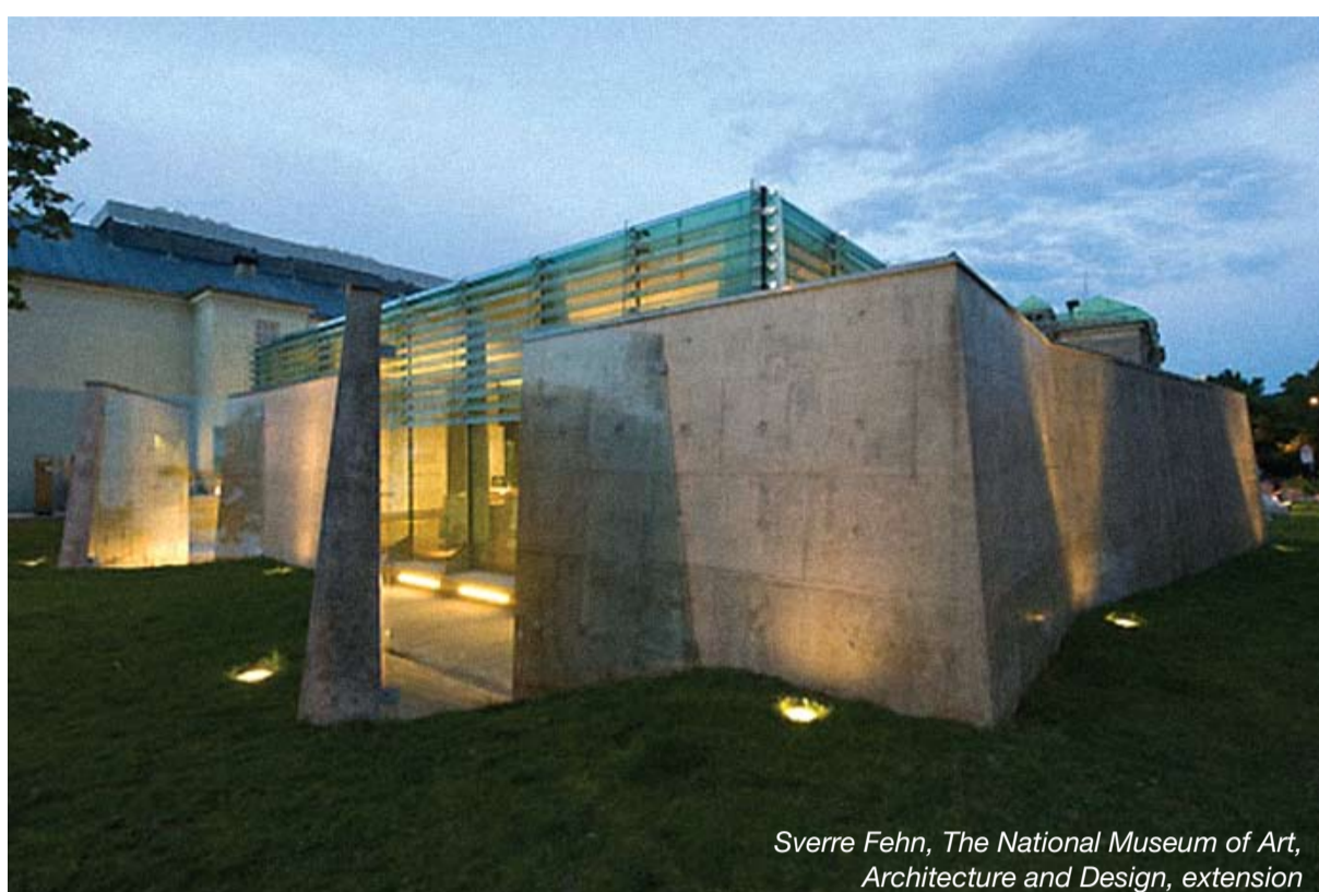
Sverre Fehn, The National Museum of Art, Architecture and Design, extension

Pozivamo Vas na otvorenje izložbe i predavanja / We are inviting you to the opening of the exhibition and lectures