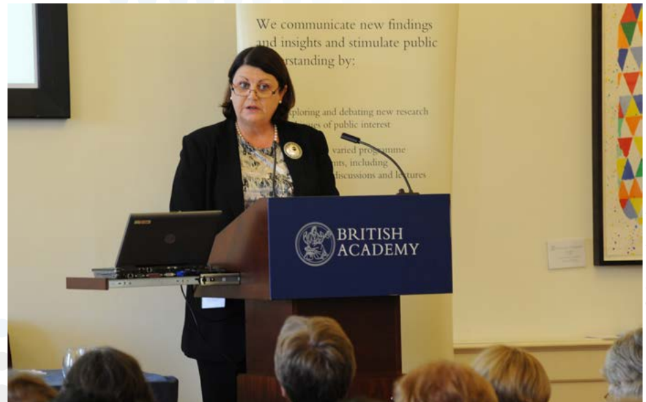
Commissioner Máire Geoghegan-Quinn holding a speech on “The future of the social sciences and humanities (SSH) in Horizon 2020” at the British Academy

One of the most contentious parts, if not the most contentious, of the Horizon 2020 negotiations has been on the budget available for SSH. As SSH is being 'embedded' it does not have a formal budget as it did in Framework Programme 7 when SSH received € 623 million. The Commission's line has been that no particular research area will receive any discipline-related funding as Horizon 2020 will fund projects via a challenge-drive approach. That is all well and good but it depends on the structures to implement the content of the Work Programmes and Calls, which as we have highlighted above