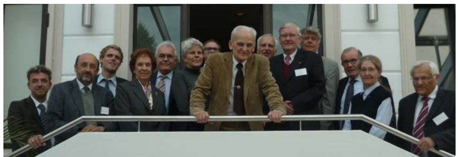
Participants of the Working Group meeting in October 2013 in the DRZE, Bonn

Please click here to download the statement “Ethics Education in Science”. Printed copies of the statement will be provided upon request ( secretariat@allea.org ).