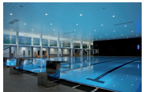
Indoor swimming-pool, Dornbirn, Vorarlberg Architecture: Cukrowicz/Nachbaur