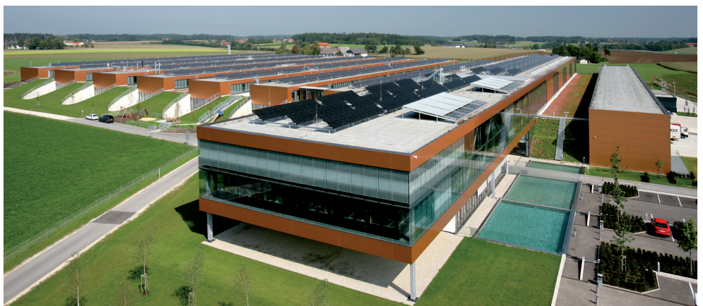
Fronius plant, Sattledt, Upper Austria Architecture: Benesch/Stögmüller © Benesch/Stögmüller