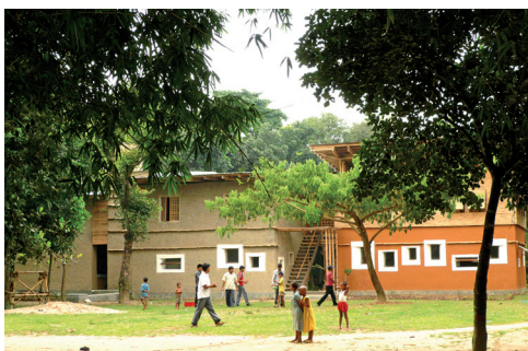
Vocational college in rammed earth, Bangladesh Architecture: A. Heringer