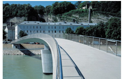
Cycle- and pedestrian bridge "Makartsteg", Salzburg Architecture: Halle 1