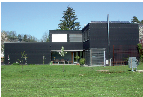
Passive-house EL, Feldkirch, Vorarlberg Architecture: W. Unterrainer