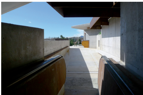
New pedestrian access Castello Rivoli, Turin Architecture: Hubmann/Vass © Hubmann/Vass