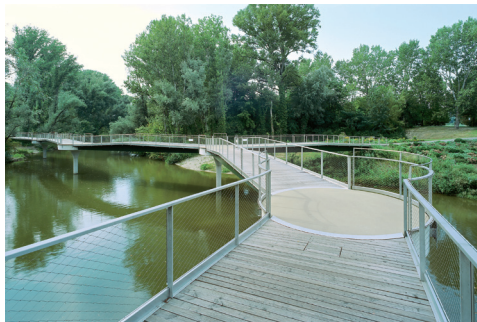
"water-lily-bridge" Tulln, Lower Austria Architecture: Bulant/Wailzer