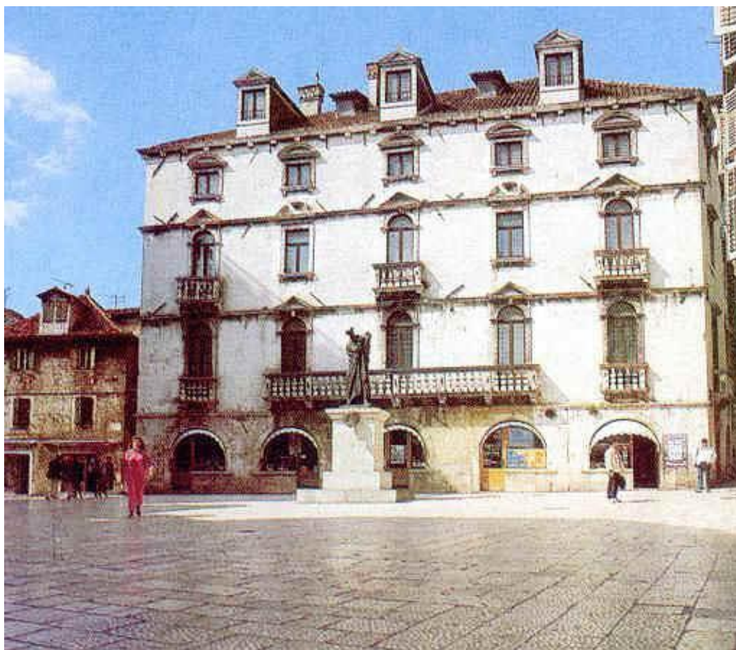
Croatian Academy of Sciences and Arts, Institute for Scientific and Artistic Work in Split

Place: Croatian Academy of Sciences and Arts, Institute for Scientific and Artistic Work, Trg braće Radića 7 (Milesi Palace), Split.