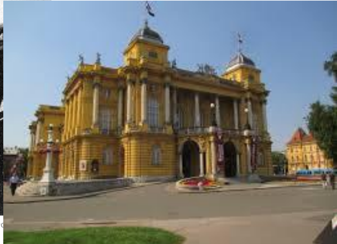
Rossini after Rossini, Lucca 19-21 October